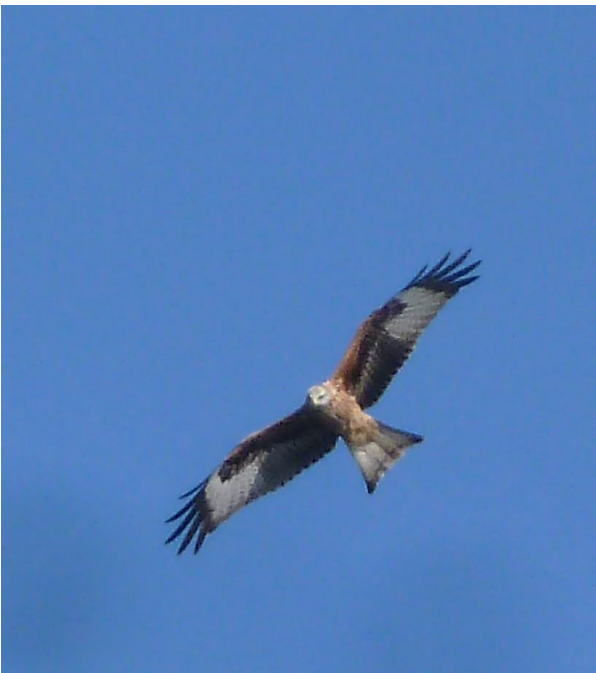
Red Kite seen drifting over the Cliff Villages last week