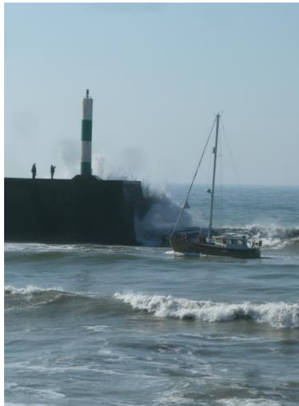
Brave boat in wild waves at Aberystwith