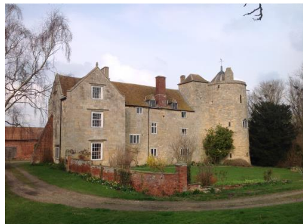
Somerton Castle, Boothby Graffoe