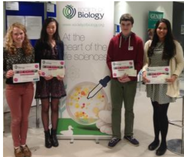
Senior winners of the Biology competition run by our East Midlands Branch of the Society of Biology. More entries wanted next year!

Potterhanworth Youth Club is thriving with 25 children attending on Thursdays 6-9pm, including through the holidays. Currently all ages attend at the Pavillion and there are excellent parent helpers.