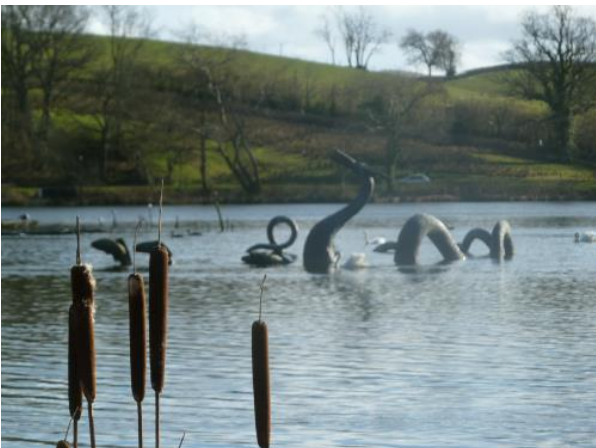
Misty dragons writhe in Llandrindod - a good place to help develop a Welsh Independent Network of councillors!